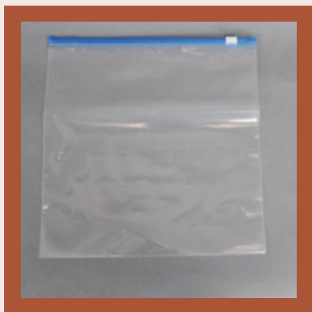
Grapes Slider Ziplock Bag