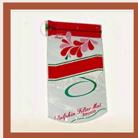
PP Zipper Bags