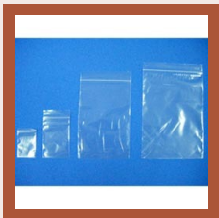
Plastic Zipper Bags