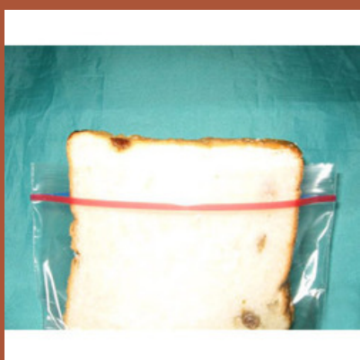
Sandwich Zipper Bag