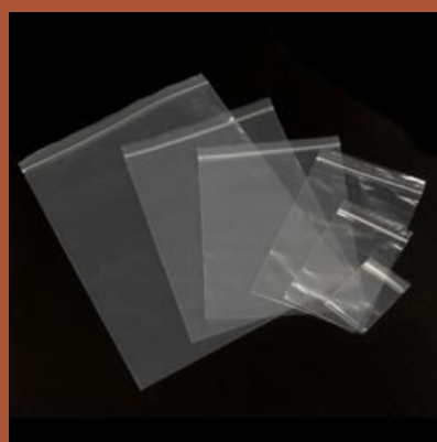
Food Storage Zipper Bags