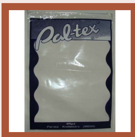
PP Slider Ziplock Bags