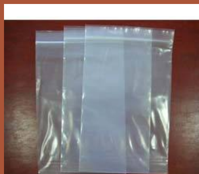
Snacks Zipper Bag