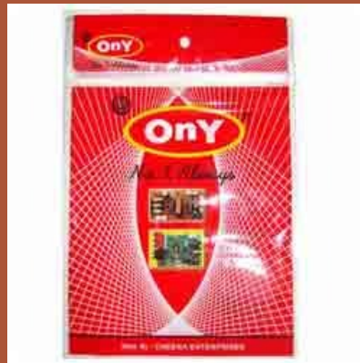
BOPP Ziplock Bags