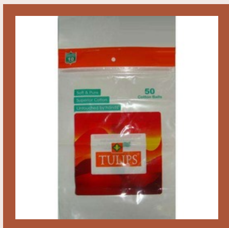
Box Pack Services