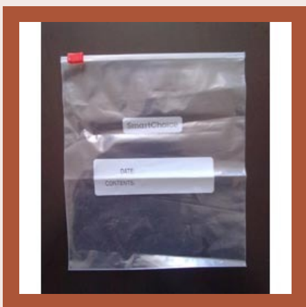
Standard Slider Bags

We are one of the leading manufacturers and suppliers of an extensive range of Slider Bags . Manufactured using only optimum quality raw material, procured from the most reliable vendors, having years of experience in this domain, this range complies with the international quality standards and norms.