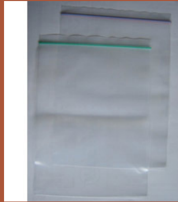
Polypropylene Ziplock Bags