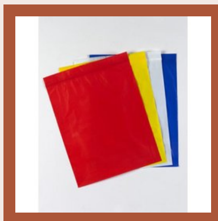
Colored Zipper Bags