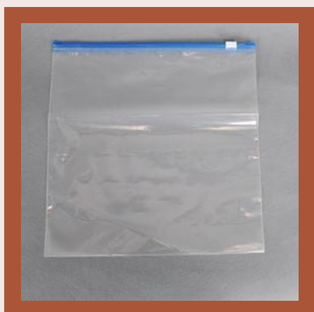
Zipper Slider Bags