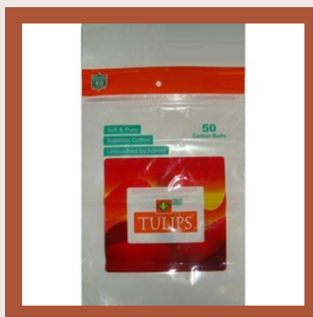
PP Attached Zipper Bags