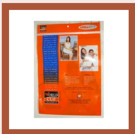
PE Attached Zipper Bags