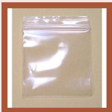
Standard Zipper Bags

We are one of the coveted manufacturers and suppliers of a wide array of Zipper Bags . Manufactured using premium quality raw material, which is procured from certified vendors, this range is in compliance with the international quality standards and parameters.