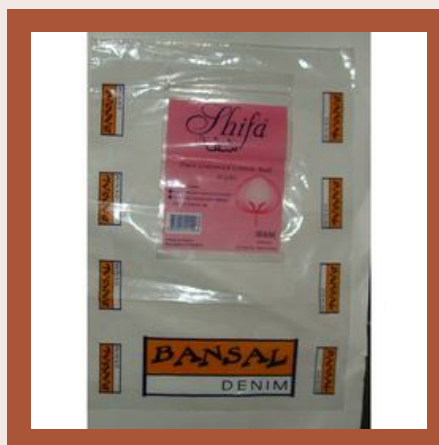
Plastic Slider Bags