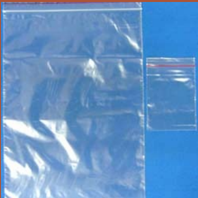
Transparent Ziplock Bags