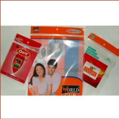
Printed Ziplock Bags