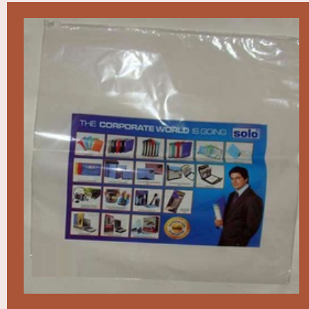
BOPP Slider Bags