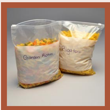
Slider Freezer Bag