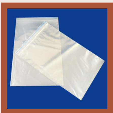
Freezer Zipper Quart Bags