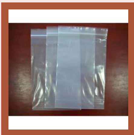
Medical Ziplock Bags