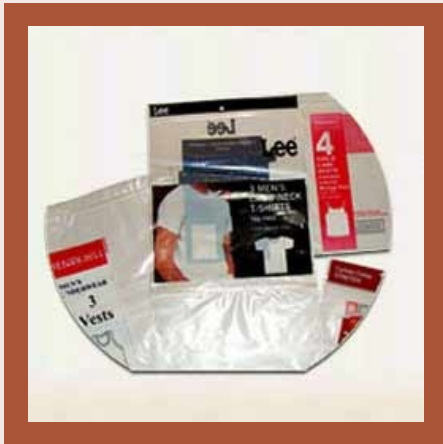
LDPE Slider Bags