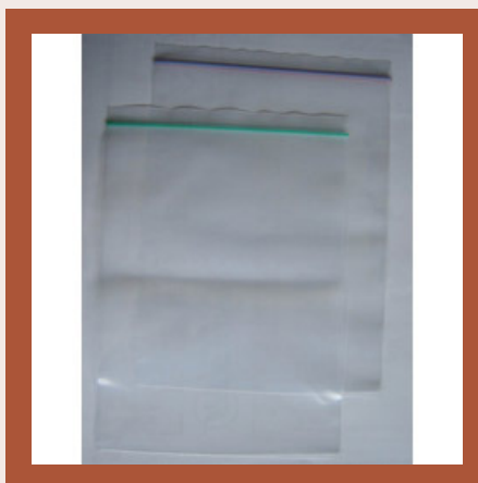
Food Storage Zipper Gallon