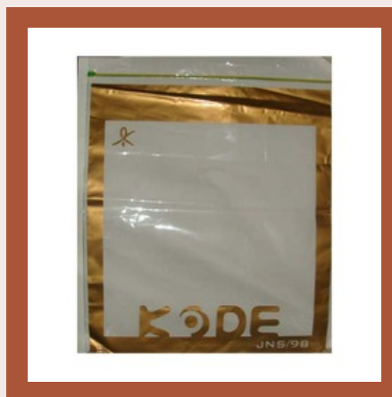
Bag Pack Services