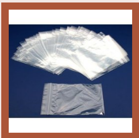
Food Storage Zipper Quart