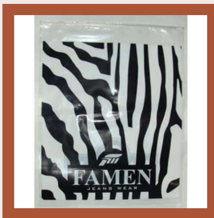
Jumbo Slider Ziplock Bags